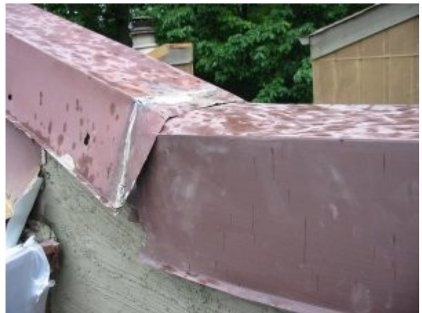
Bottom cap is removed and pushed under the upper cap. The overlap prevents water infiltration. This would have been prevented if the bottom piece was put on first, 30 years ago.

Protecting the work after it's finished is out of the control of the plasterer. All I can do is insist that things like roof caps are done, but I don't put them on.