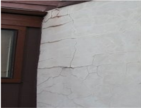
Badly cracked up and loose stucco caused by leaking roof cap