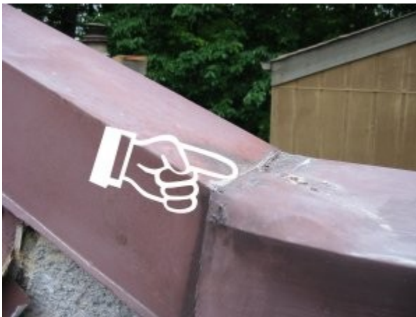
The culprit was this roof cap. Water runs right down the cove in the cap and gets behind the stucco.