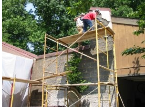
An ounce of prevention is worth 3,000 lbs. of cure. Whole wall is stripped down to block. This assures a nice job. Patches almost always show.